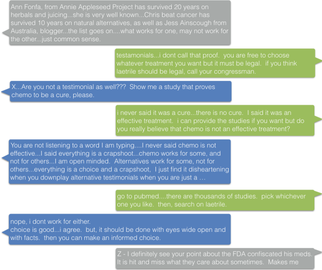
Figure 1: An example debate in thread as the input of our model. Green and blue posts were published by two users engaged in the debate with opposing opinions respectively. Grey posts are not engaged in the debate, but provide as context. User names are removed from the text and replaced by X, Y, and Z, from which it could be seen that debate detection is highly context-dependent.

timent, and whether they are involved in the same debate. Figure 1 shows an example of a series of debate posts in a thread with context. To build a classifier that can capture such post-to-post connections in context, motivated by the network structure in [21], we adopt a neural network architecture as shown in Figure 2. The original neural network used a CNN to capture character-level features of words, followed by feeding the output of the CNN to an LSTM to model word sequences. We adopt the same architecture in this paper, however, to first capture in-document features of posts by a CNN. This part is also identical to the document classifier created in [20], where word vectors are concatenated and filtered by a convolutional layer. The output of the CNN, where each document is represented as a document vector after the max-pooling layer, is fed into an LSTM so that thematic relations between context posts can be captured. The final output of the LSTM is an indicator whether a post is involved in debate or not, and which type of debate it belongs to.