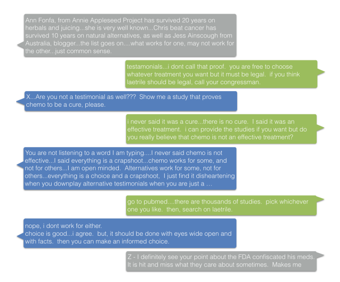
Figure 1: An example debate in thread as the input of our model. Green and blue posts were published by two users engaged in the debate with opposing opinions respectively. Grey posts are not engaged in the debate, but provide as context. User names are removed from the text and replaced by X, Y, and Z, from which it could be seen that debate detection is highly context-dependent.

timent, and whether they are involved in the same debate. Figure 1 shows an example of a series of debate posts in a thread with context. To build a classifier that can capture such post-to-post connections in context, motivated by the network structure in [21], we adopt a neural network architecture as shown in Figure 2. The original neural network used a CNN to capture character-level features of words, followed by feeding the output of the CNN to an LSTM to model word sequences. We adopt the same architecture in this paper, however, to first capture in-document features of posts by a CNN. This part is also identical to the document classifier created in [20], where word vectors are concatenated and filtered by a convolutional layer. The output of the CNN, where each document is represented as a document vector after the max-pooling layer, is fed into an LSTM so that thematic relations between context posts can be captured. The final output of the LSTM is an indicator whether a post is involved in debate or not, and which type of debate it belongs to.